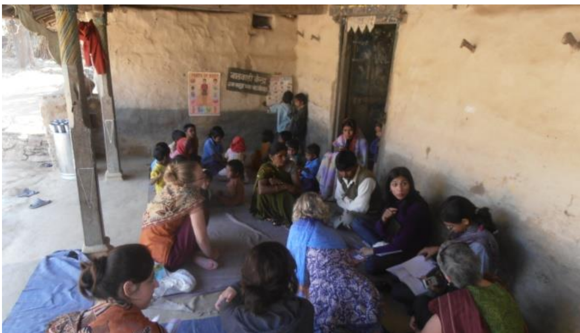
Seva Mandir, Udaipur, Rajasthan

We arrived and there were about 30 children who initially all looked absolutely terrified by us.