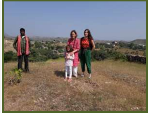
Prof. Duflo with her kids on visit to Seva Mandir field

Seva Mandir is proud to be a part of the journey and the work done by Abhijeet Banerjee, Esther Duflo and Michael Kremer and wishes them luck for good deeds in the future.